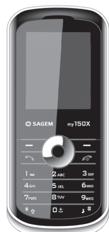
User Manual my150X