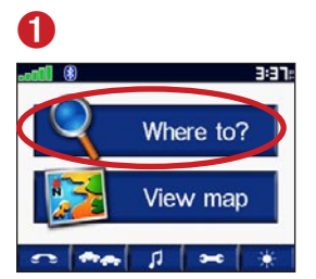
Touch Where to?.

The Where to? menu provides several different categories for you to use when you search for locations